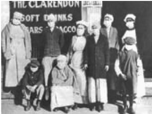
Although people dutifully wore masks, these provided only a very limited protection against the influenza virus. [Credit: Office of the Public Health Service Historian]

In Ohio, the pandemic peaked during the fall of 1918. It gradually declined during the winter and spring. By the summer of 1919, it had disappeared from the state. Cities and rural communities across the state experienced high rates of influenza as well as significant numbers of deaths from influenza or pneumonia.